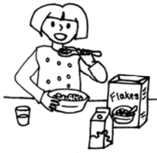
Eat my Breakfast