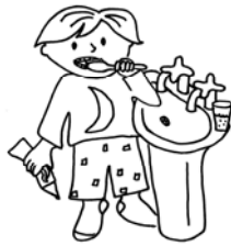
Brush my teeth